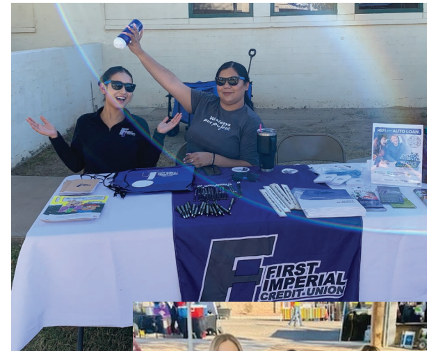
Brawley team at the Westmorland School Health Fair