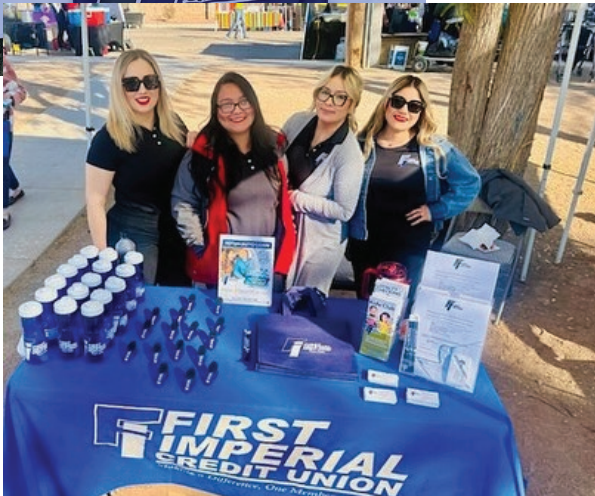
Calexico team at the Heber Tamale Festival.